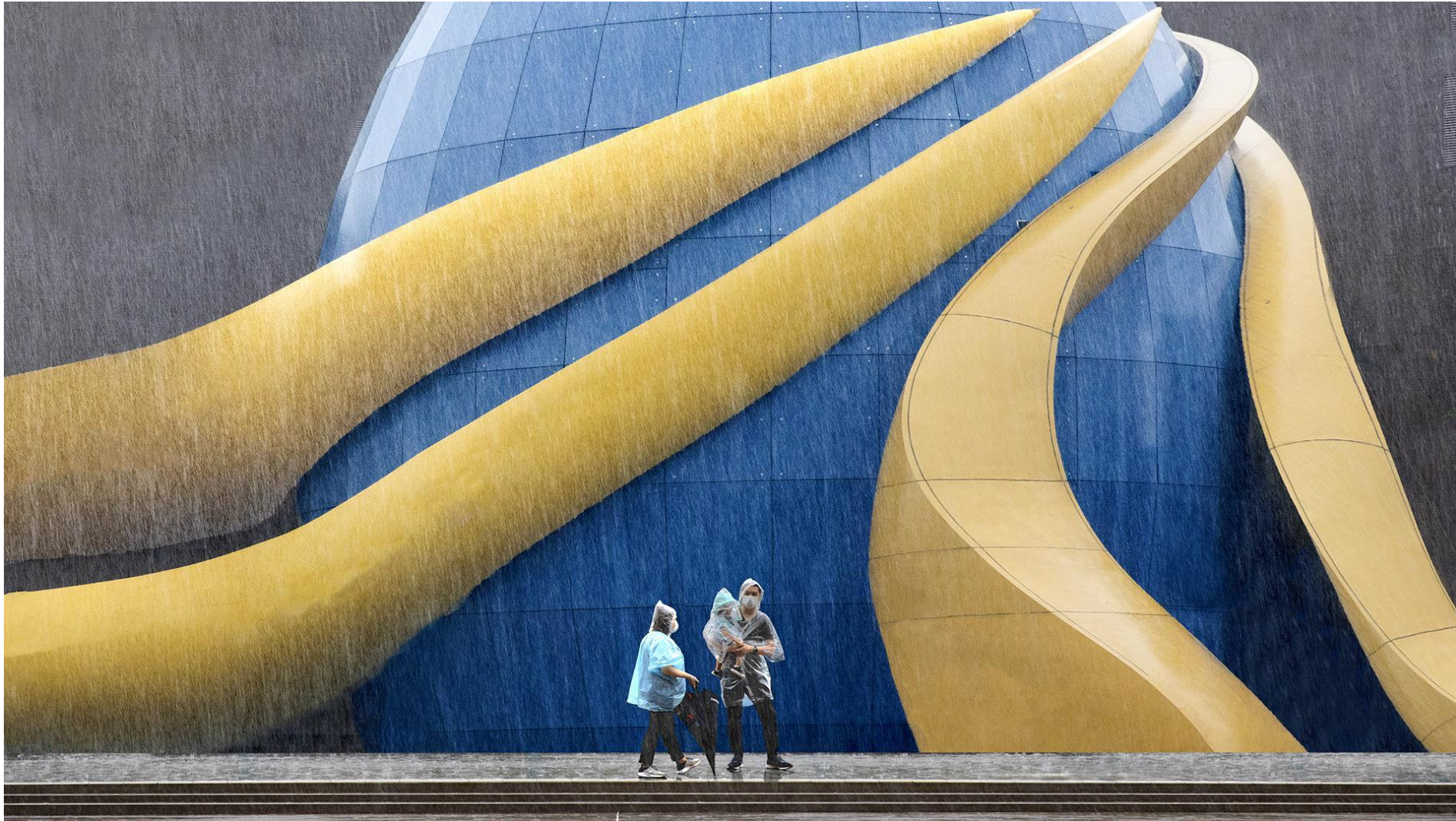
NPS eHM | Park in raining C05 | HW CHAN | Hong Kong