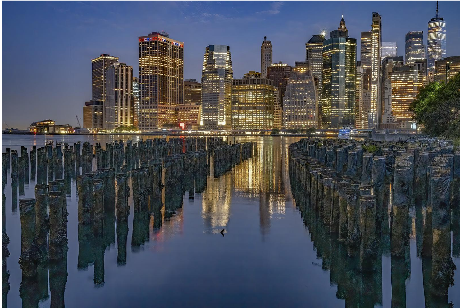
NPS eHM | Before Sunrise | JR Schnelzer | USA