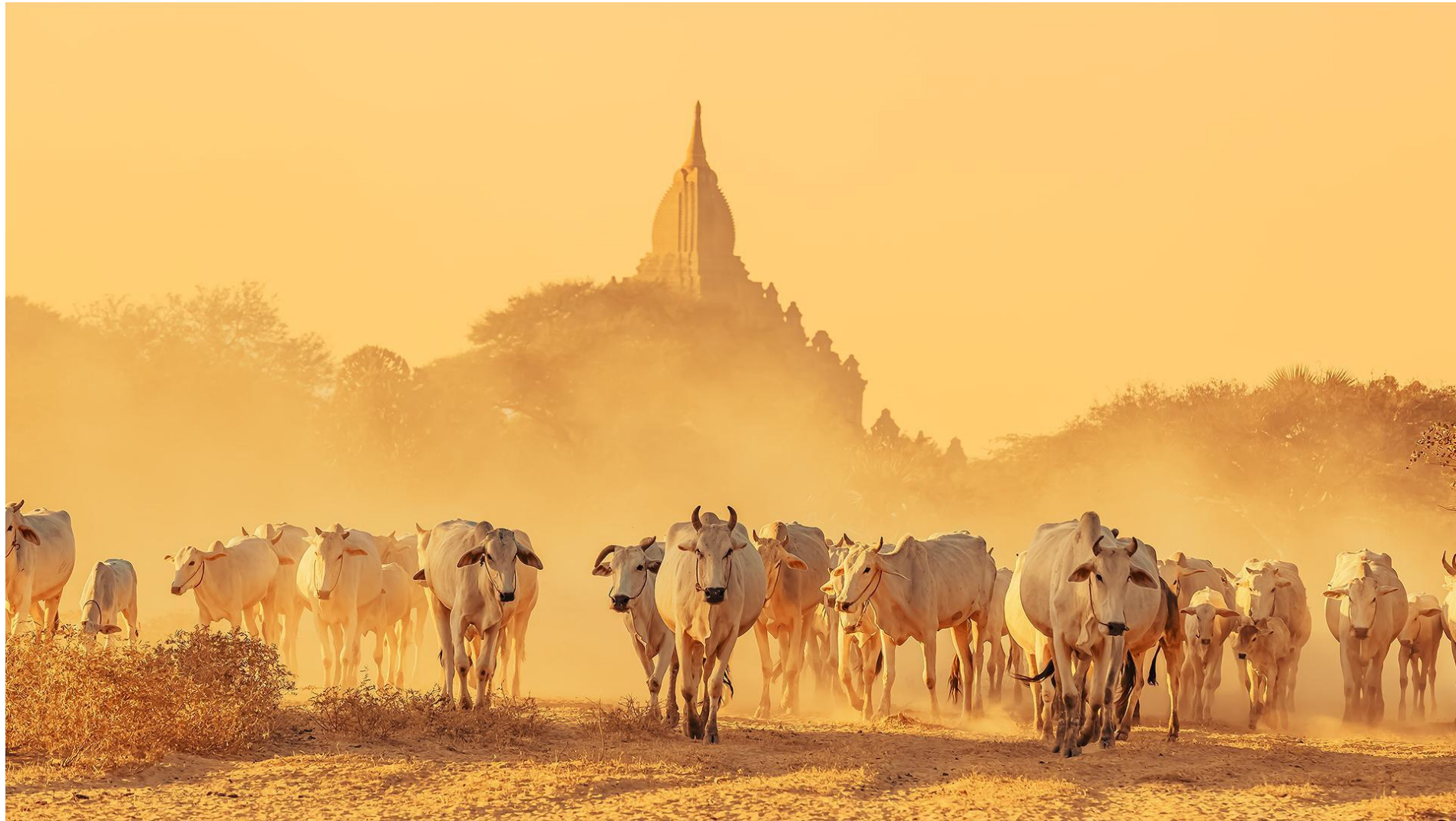
NPS Bronze Medal | magical land 016 | Engseng Saeyang | Thailand