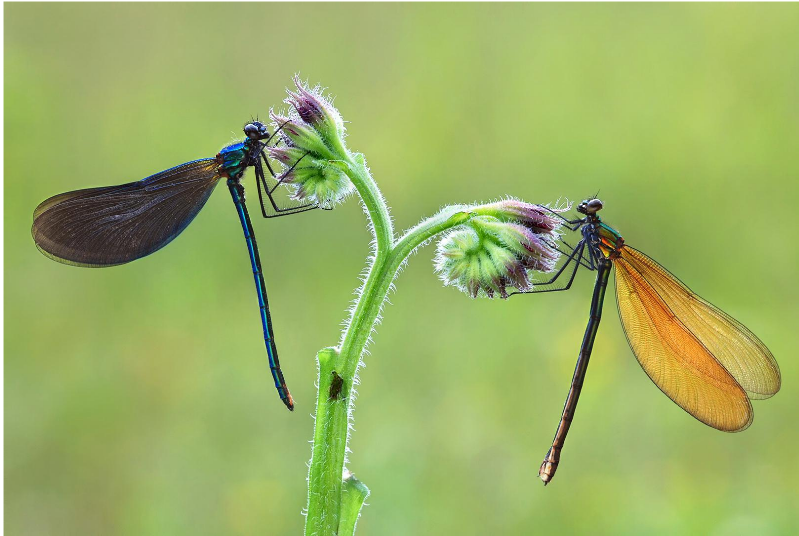
NPS eHM | Paartje Bosbeekjuffers | Rene Van Echelpoel | Belgium