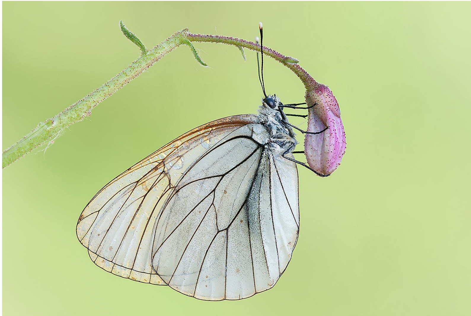
NPS eHM | SIGNORA IN BIANCO | Sergio Boletti | Italy