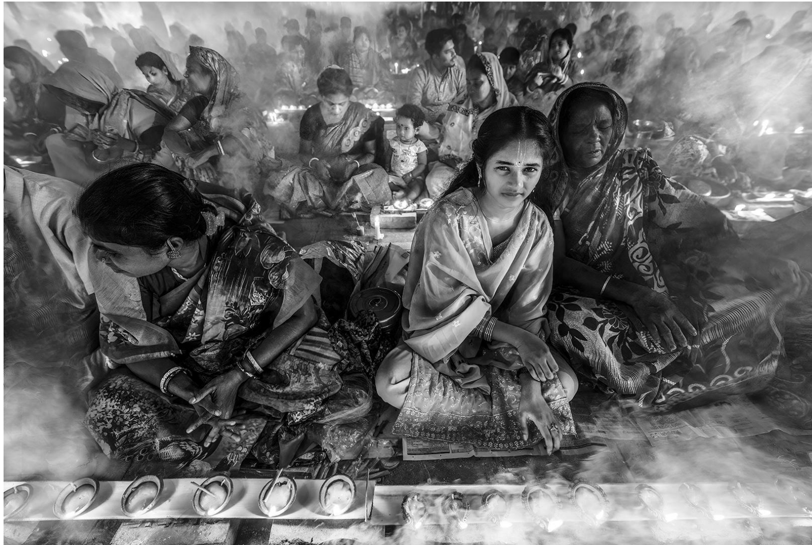
NPS eHM | Dhaka Light Festival 02 | Massimo Tommi | Italy