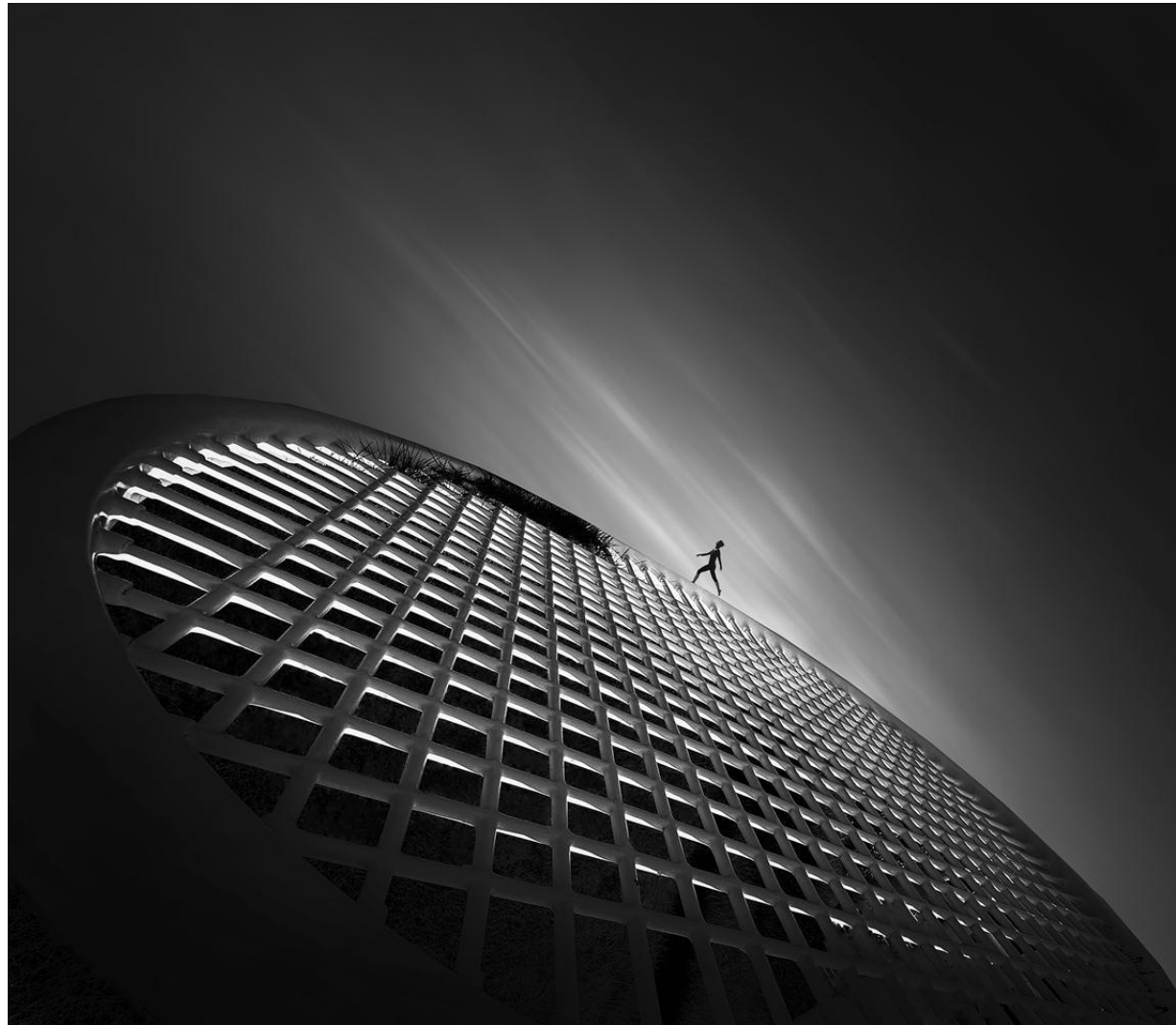
NPS eHM | Encircle | Zhong An Yu | China