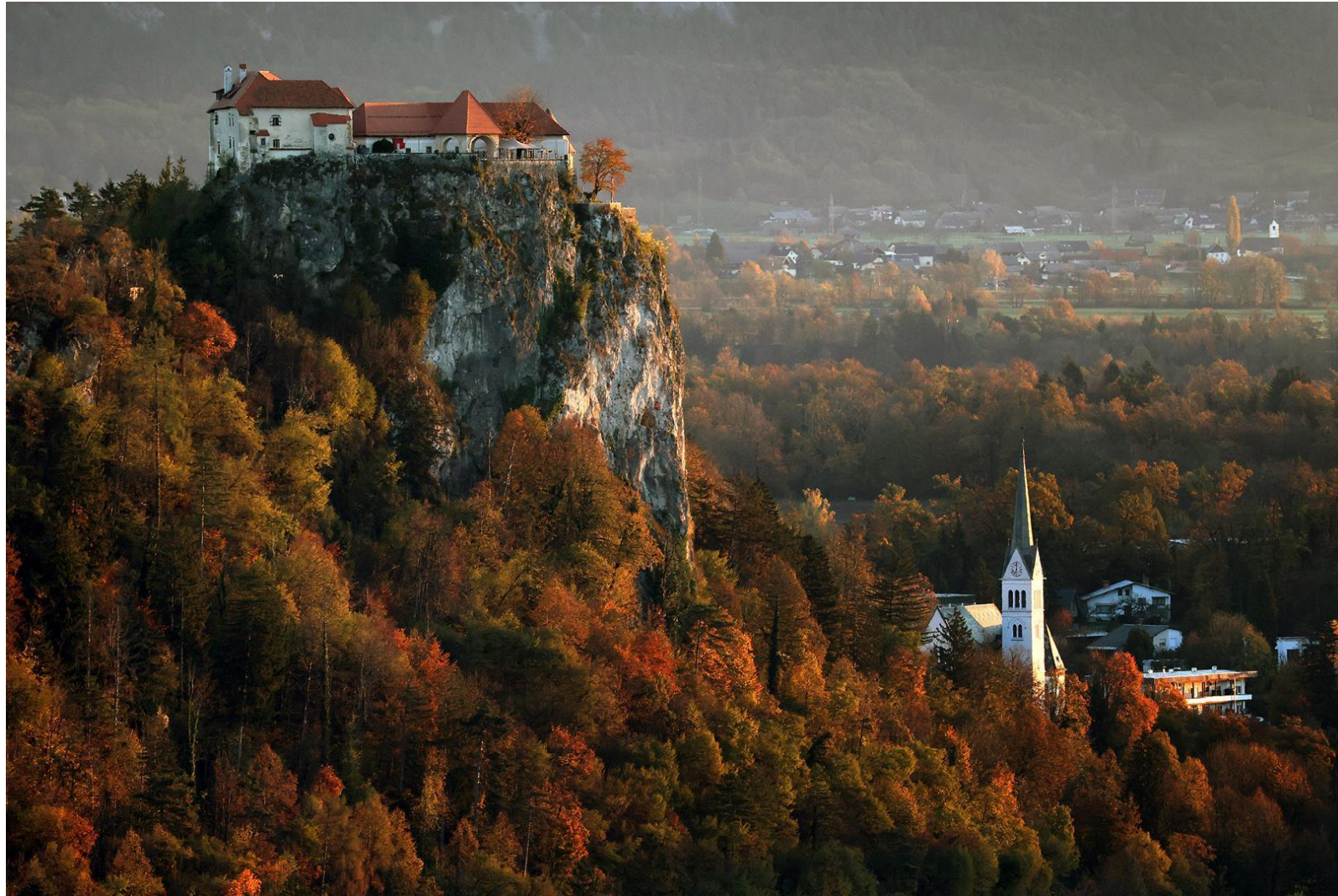
NPS eHM | Bled Castle and Church 2 | Gottfried Catania | Malta