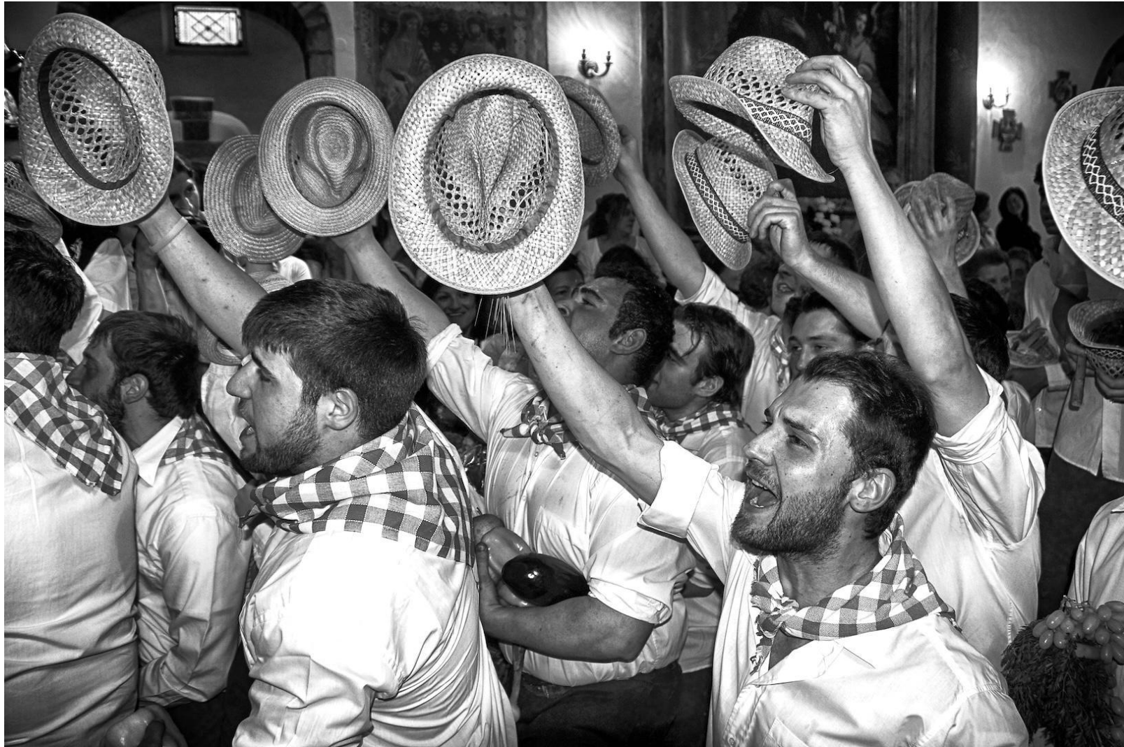
NPS eHM | Madonna del monte il saluto | Angelo Bonarelli | Italy