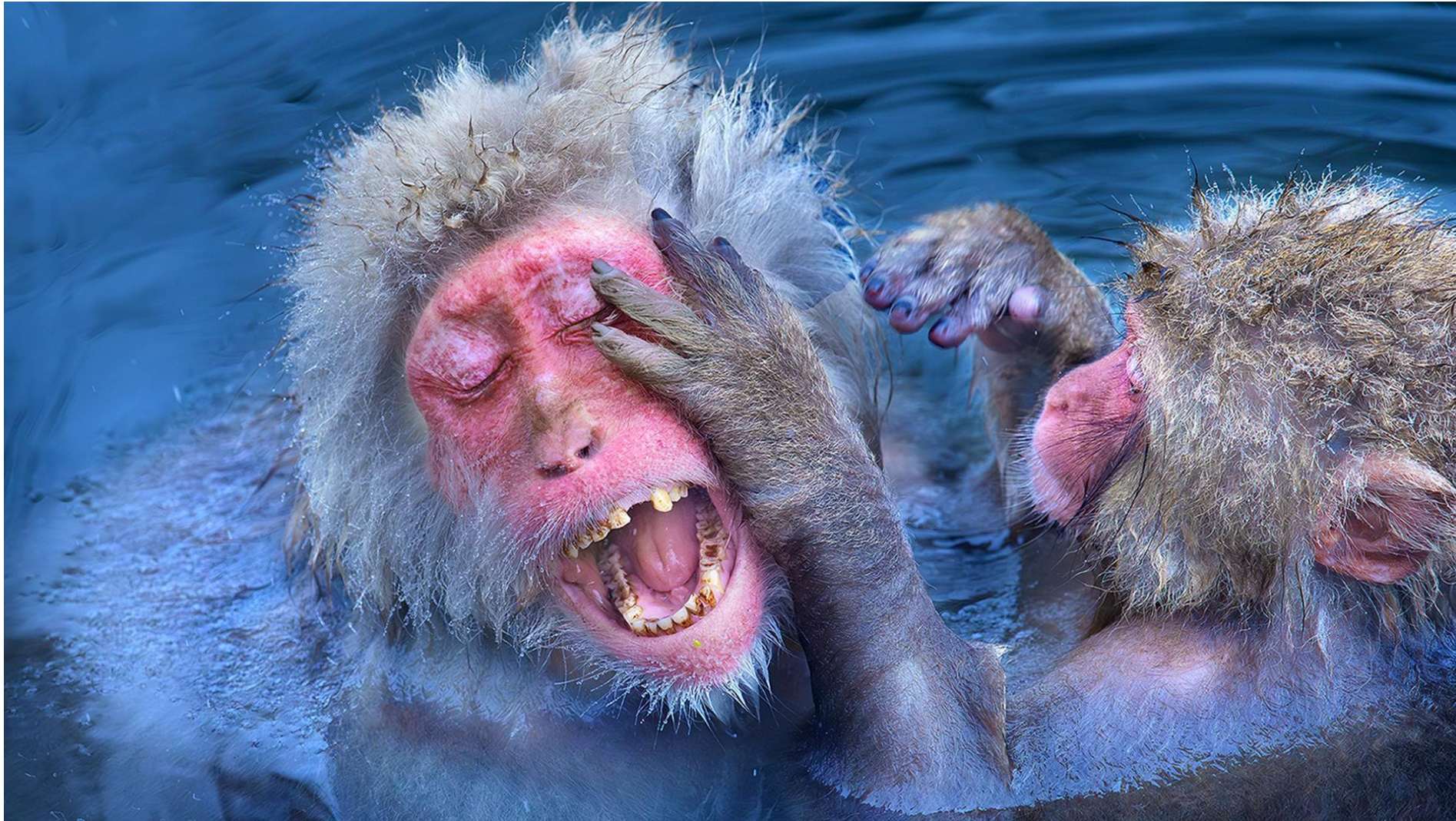
NPS eHM | Very comfortable 4 | HW CHAN | Hong Kong