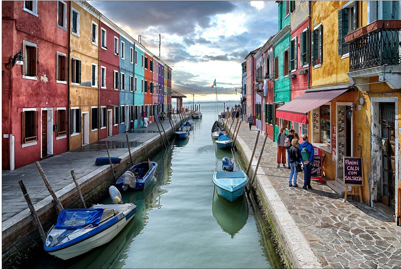
NPS eHM | Burano | KLAUS REIBL | Germany