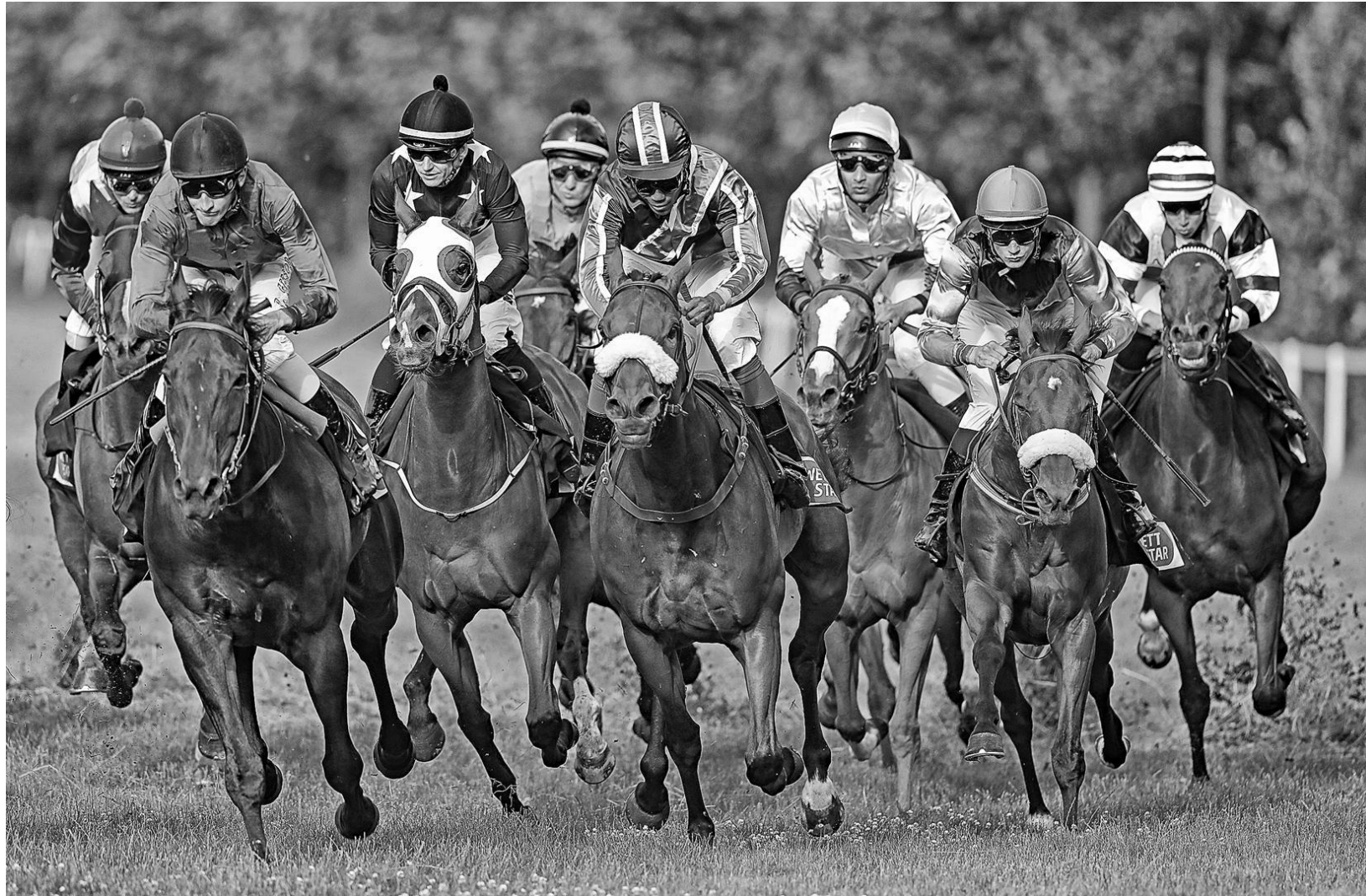
PSA HM Ribbon | Fight in the last curve | Wolfgang Kaeding | Germany