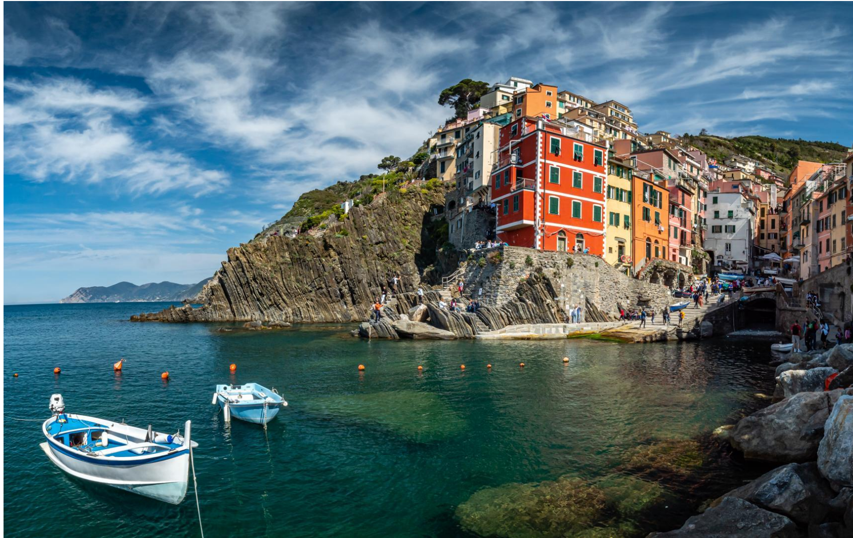
NPS Gold Medal | Riomaggiore | Gabor Bercsi | Hungary