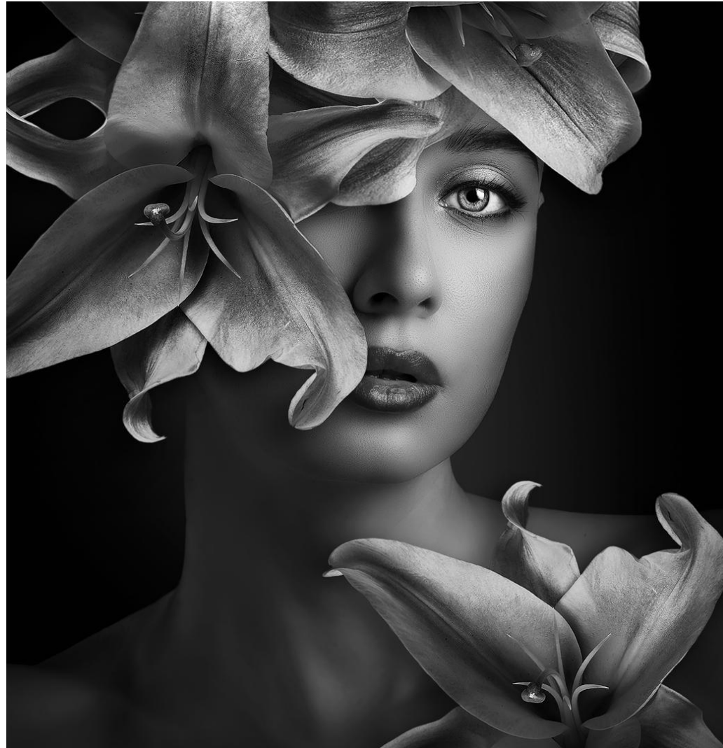
NPS eHM | Flower Eye 33 | Hau Chi Chak | Hong Kong