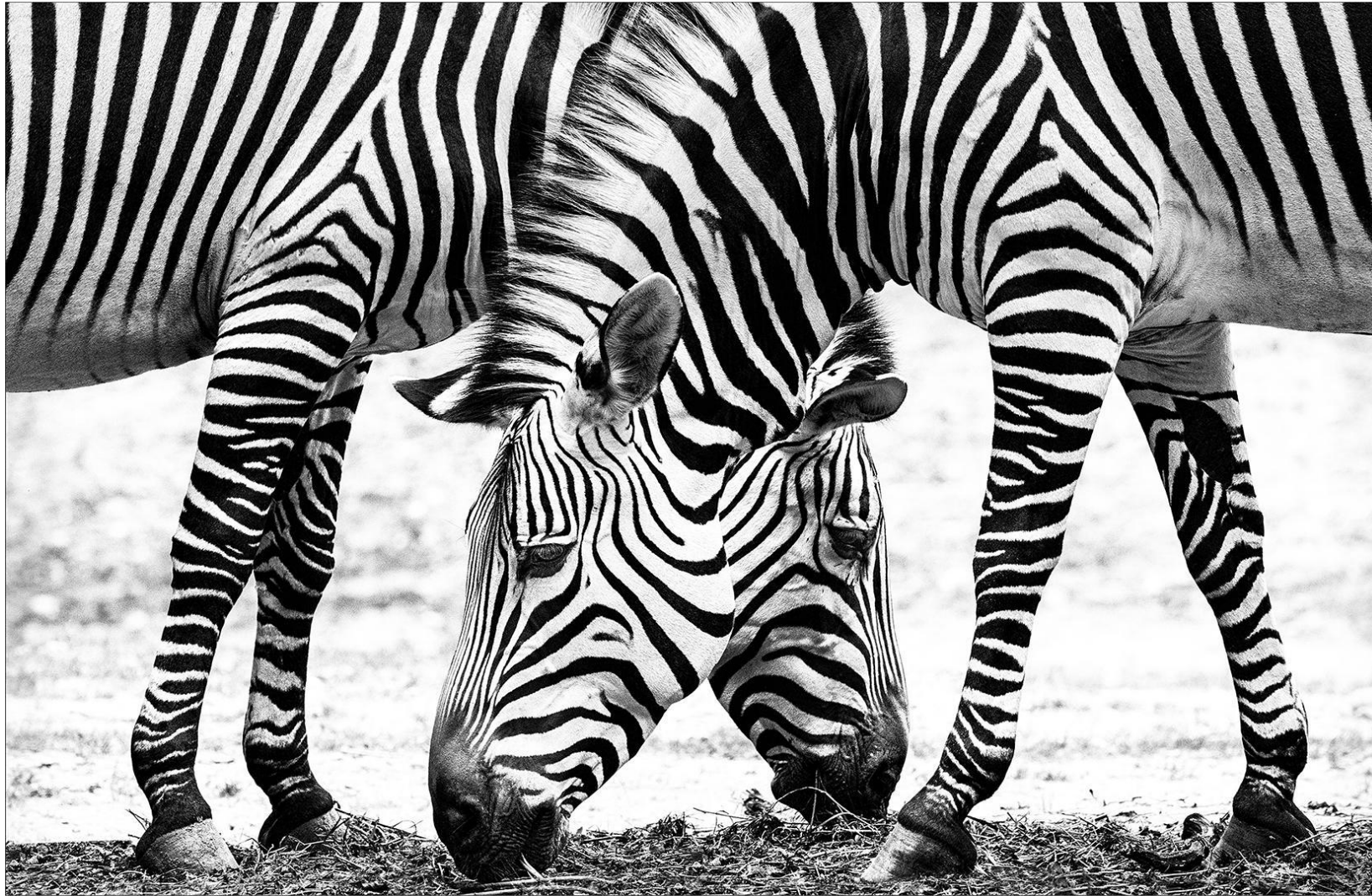
NPS eHM | Stripes | KLAUS REIBL | Germany