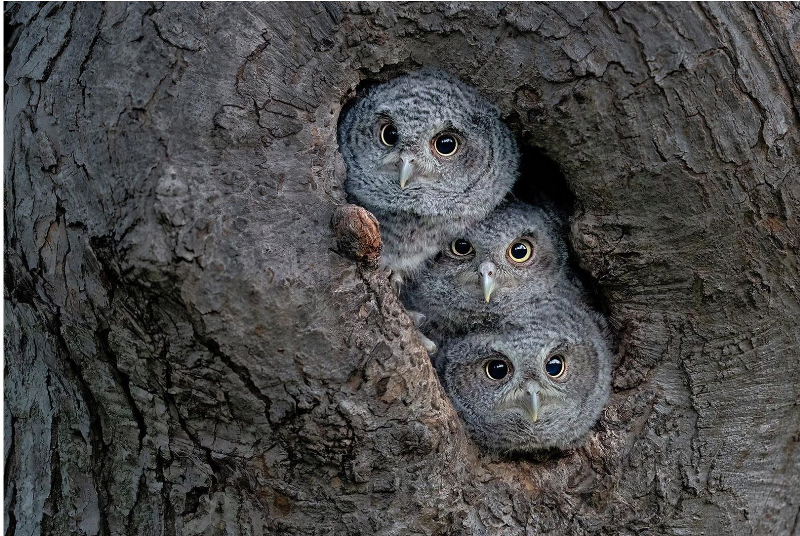
NPS Ribbon | Three screech owl chicks | Tin Sang Chan | Canada