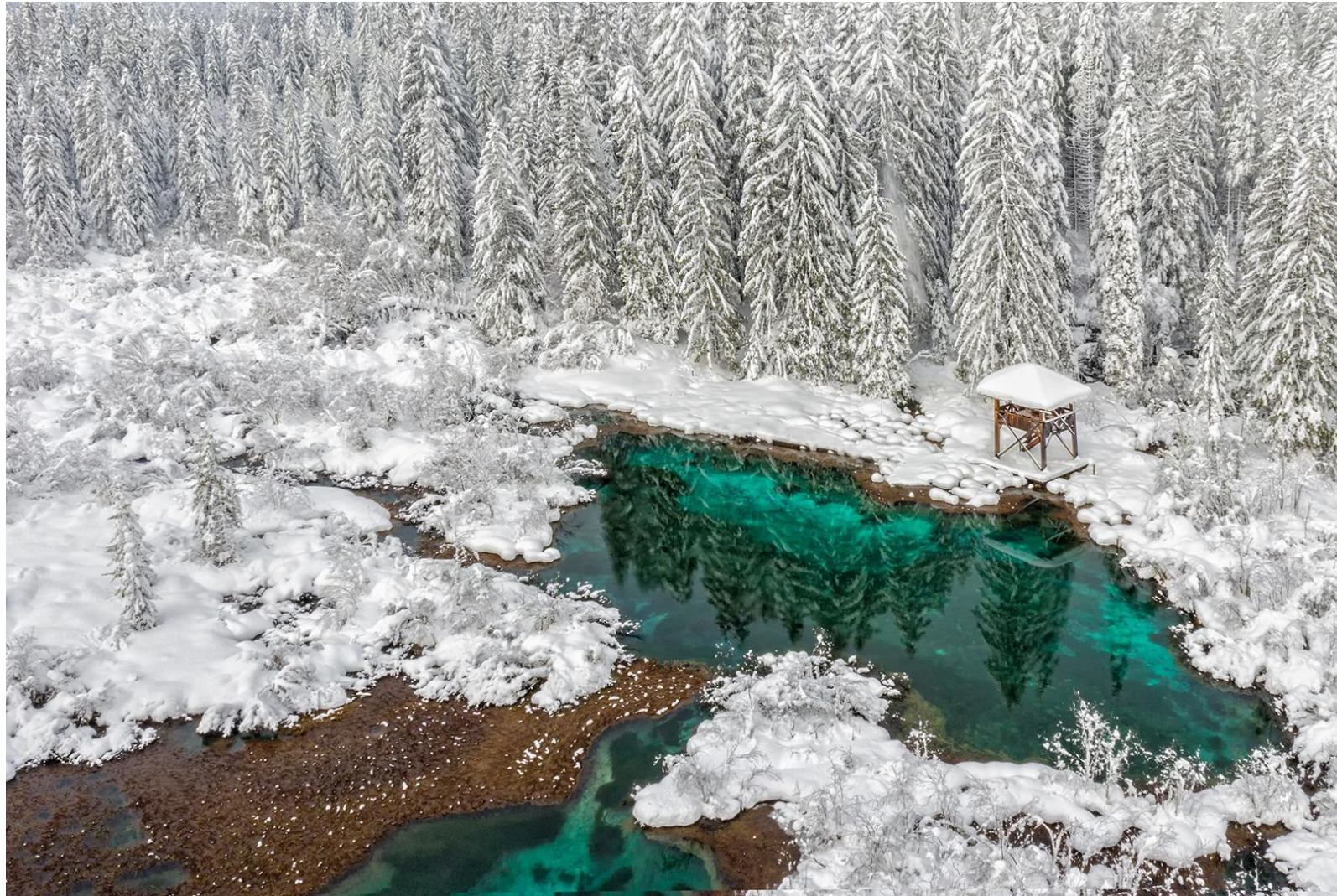
NPS eHM | Winter fairy tale | | Slovenia