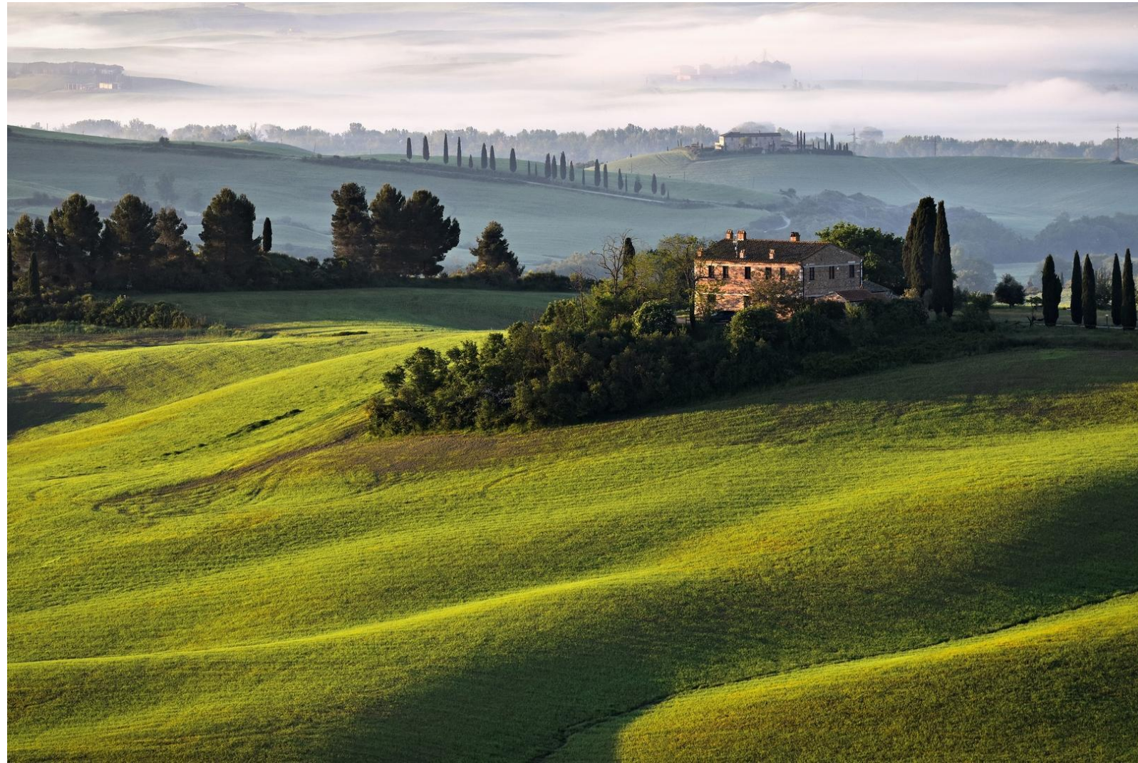
NPS eHM | Tuscany 09 | Tomasz Okoniewski | Poland