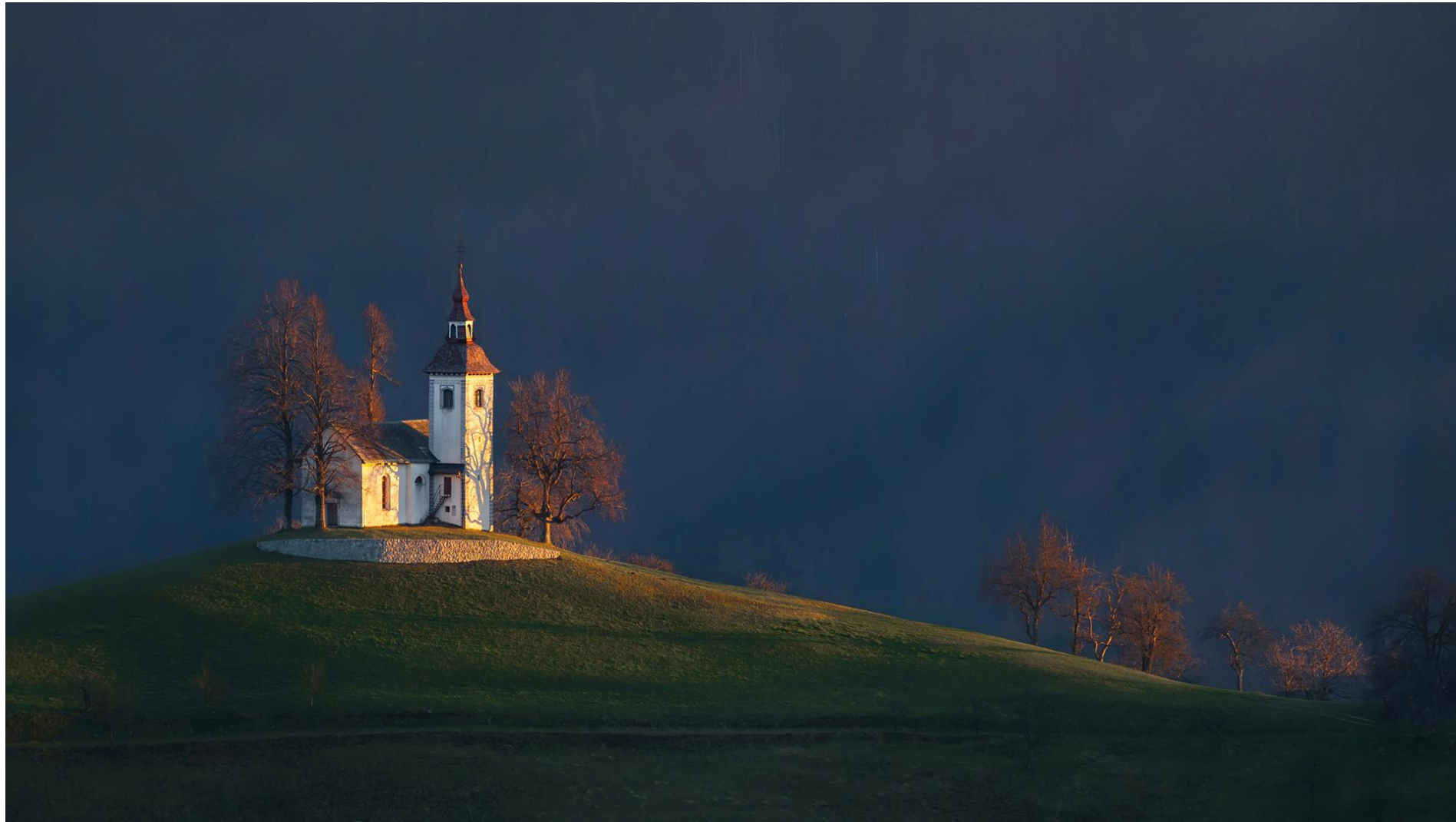
NPS eHM | The first rays of sunshine | Peter Balantic | Slovenia