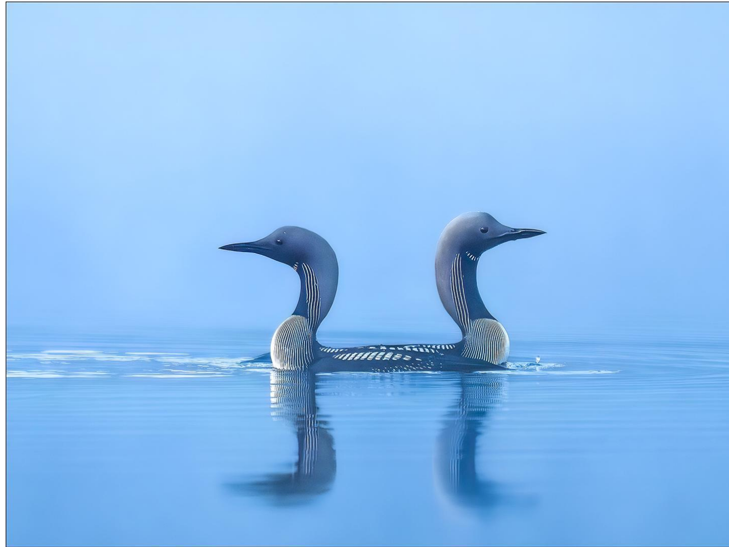
PSA HM Ribbon | Storlomer | Atle Helland | Norway