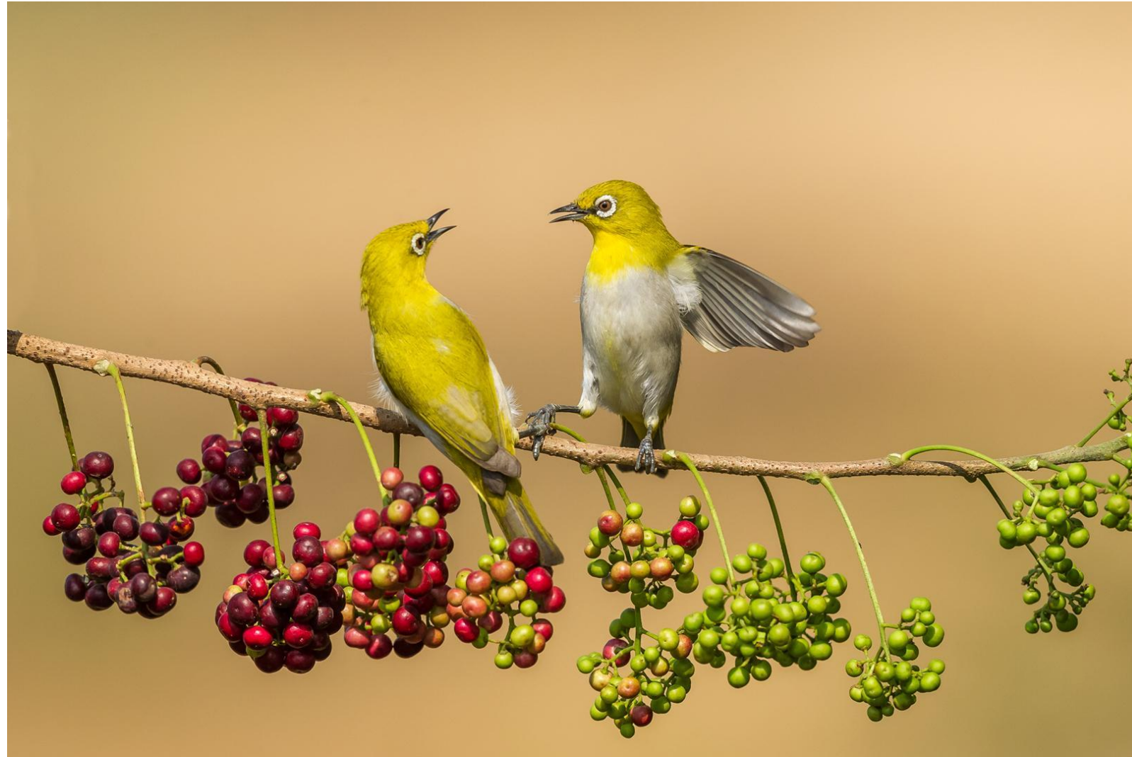
NPS eHM | ORIENTAL WHITE EYE FACE TO FACE | SATHYANARAYANA C R | India