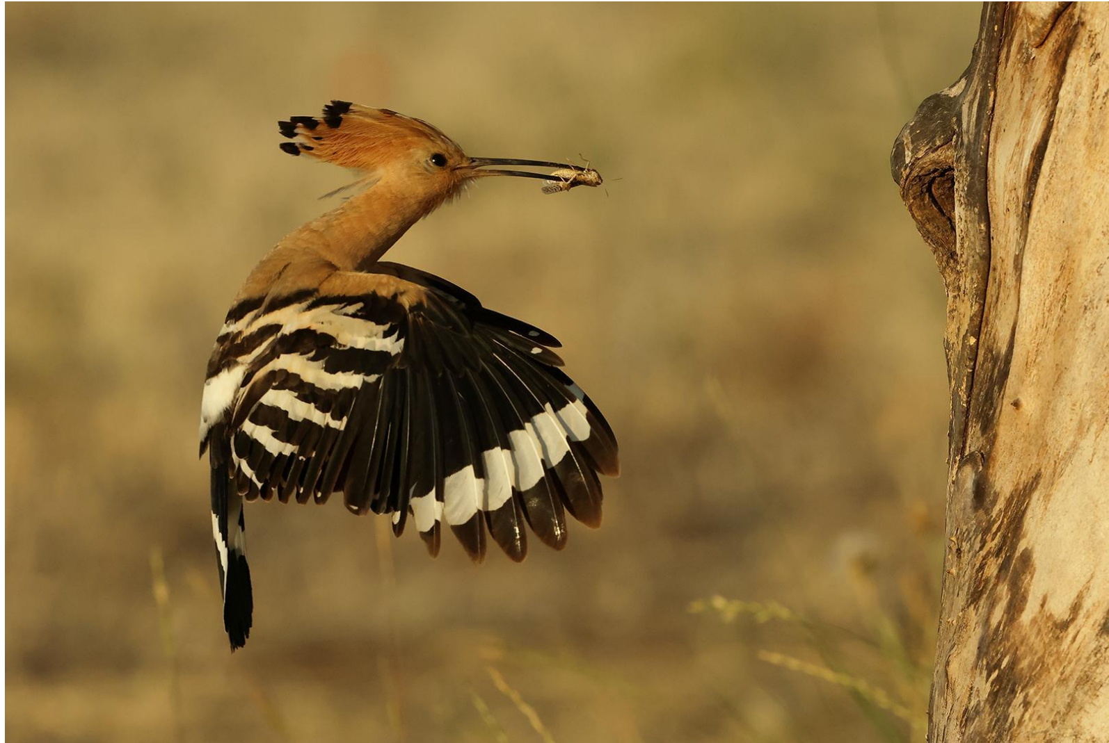
NPS eHM | hoopoe comes with grass hopper | bob devine | England