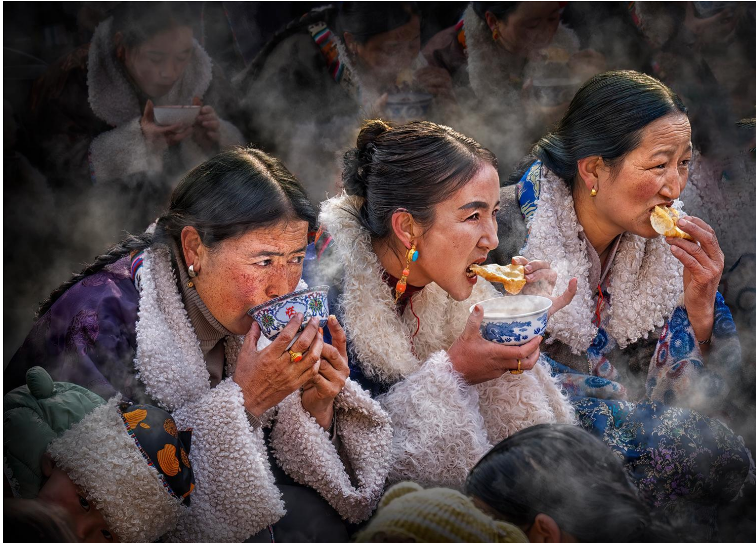
NPS Ribbon | Tea Party 202 | Hau Chi Chak | Hong Kong