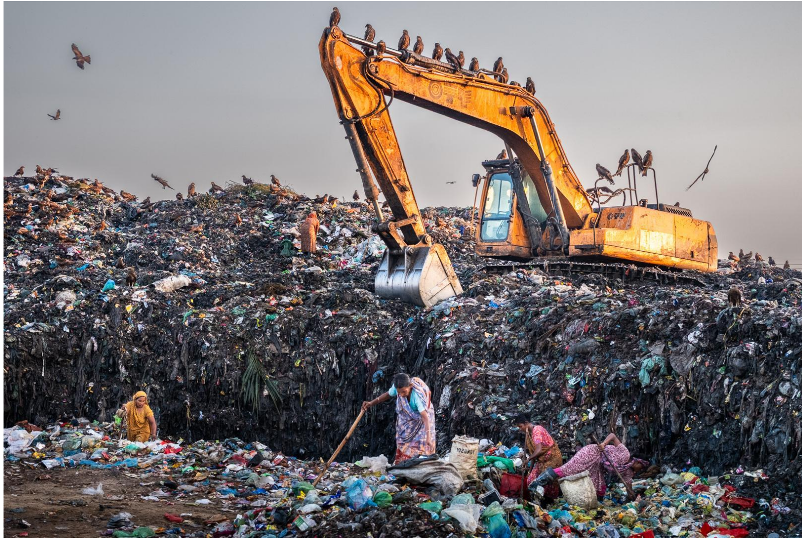
NPS Ribbon | World of Waste | Sue OConnell | England