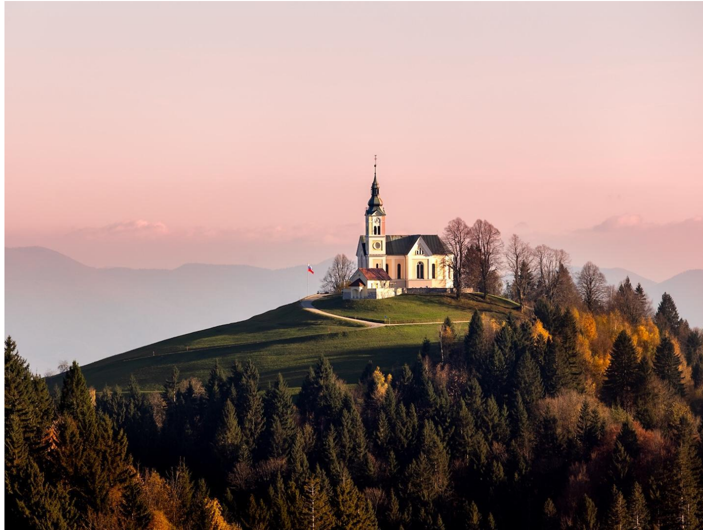
NPS eHM | Zupnijska cerkev sv Lenarta | | Malta