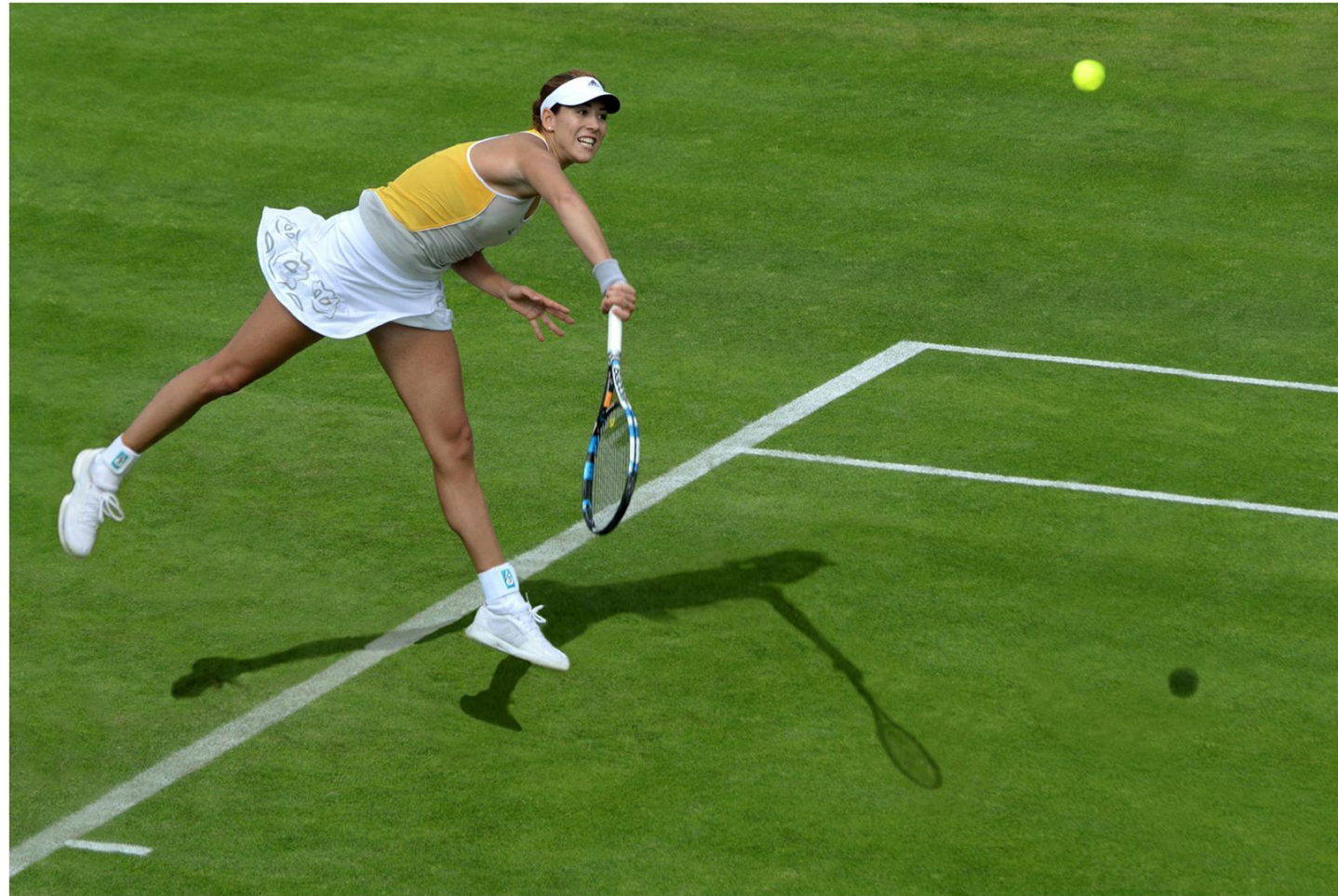
NPS eHM | Garbine Muguruza Wimbledon champion | | England

Neither PSA nor the exhibition sponsors assume any responsibility for misuse of copyright by anyone.