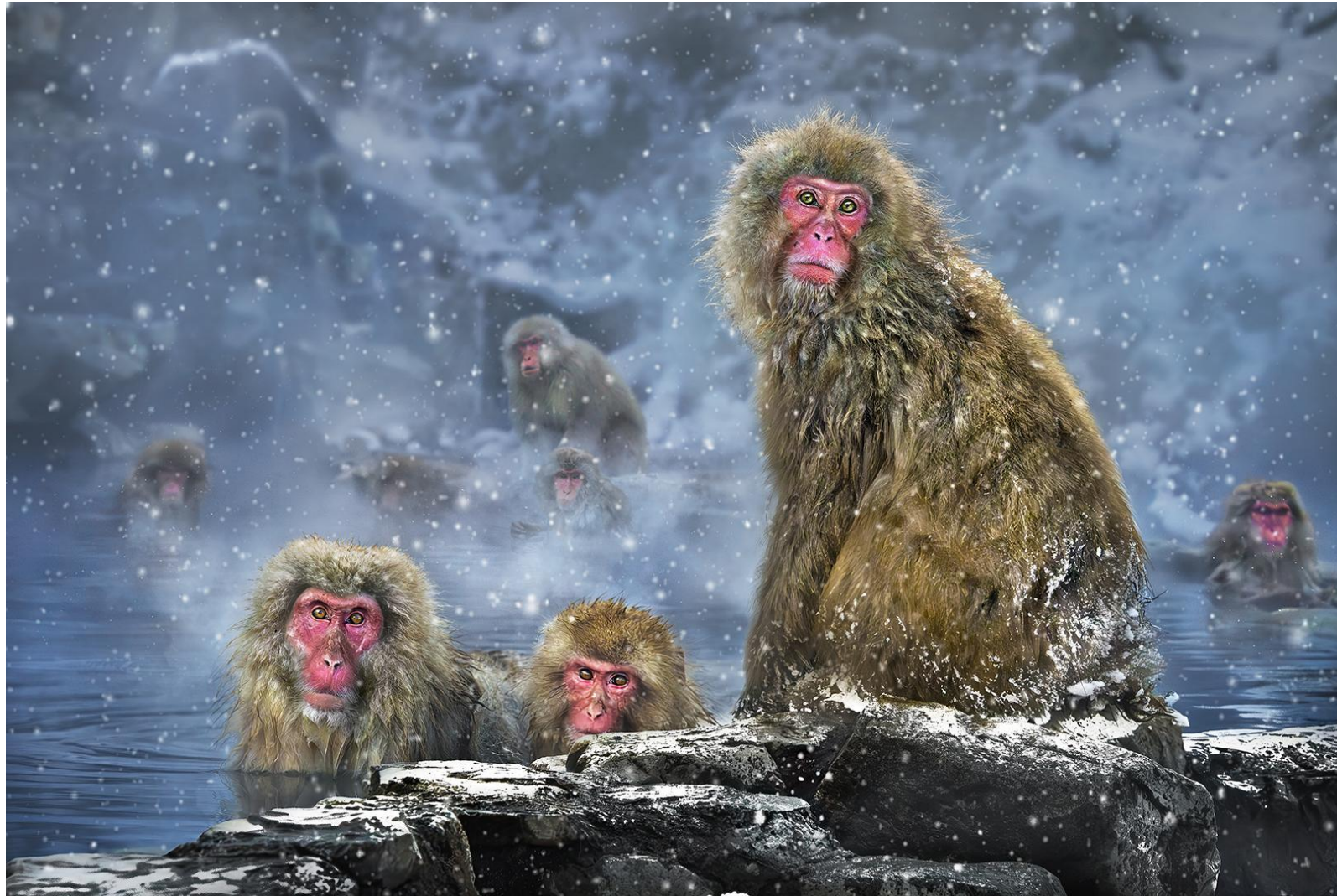
NPS eHM | Hotspring Monkeys | | Hong Kong