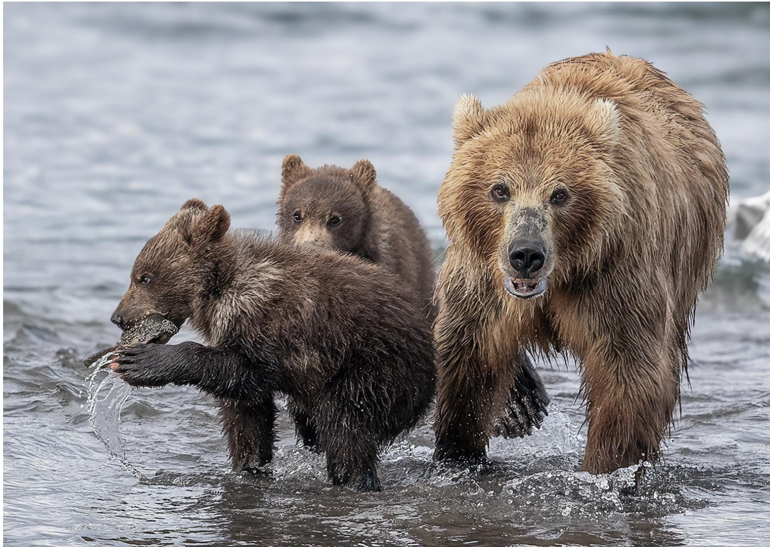
IAAP DIPLOMA | FAMILY FEAST | Suranjan Mukherjee | India