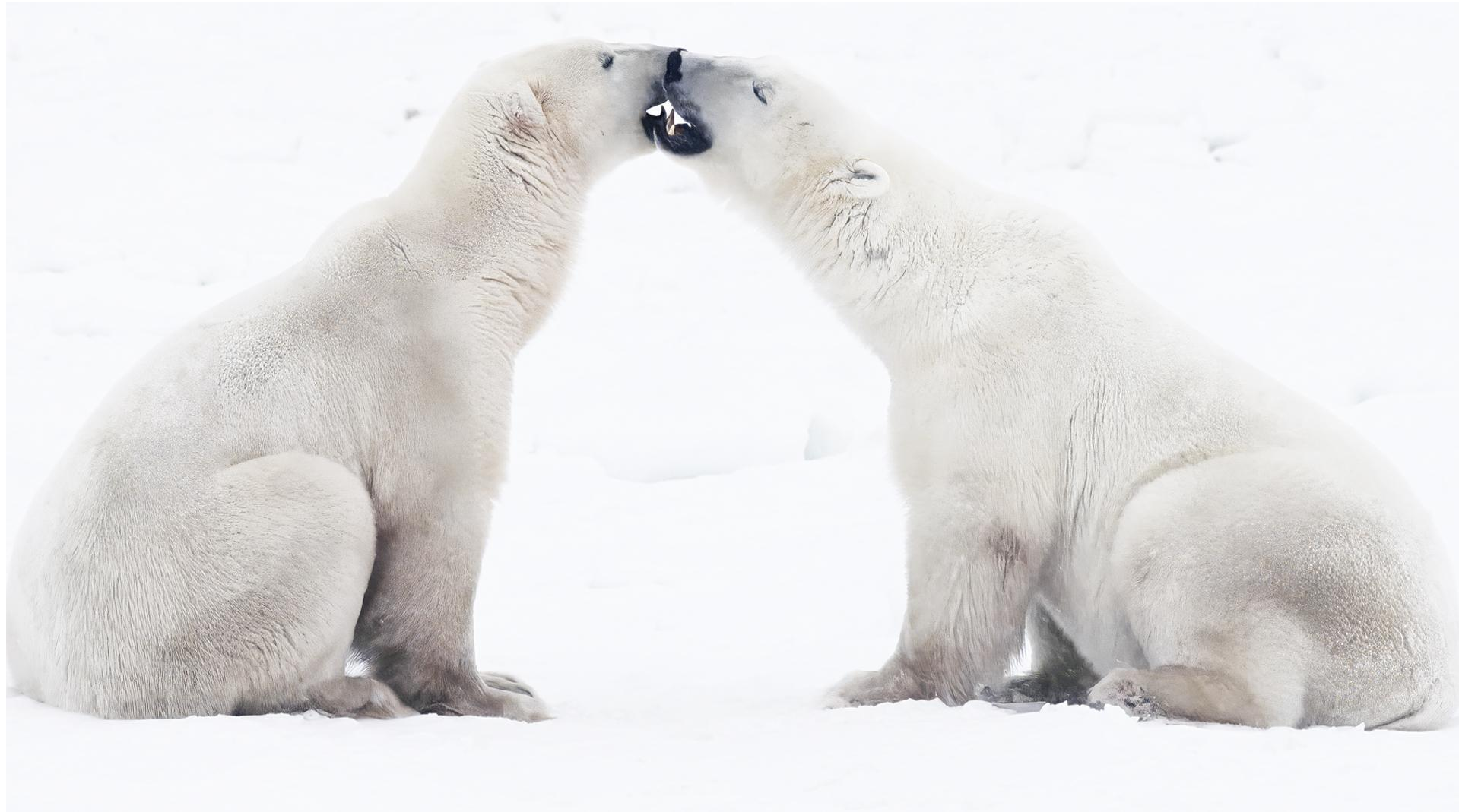
NPS eHM | Reaching for a Kiss | Gloria Boscaini | Italy