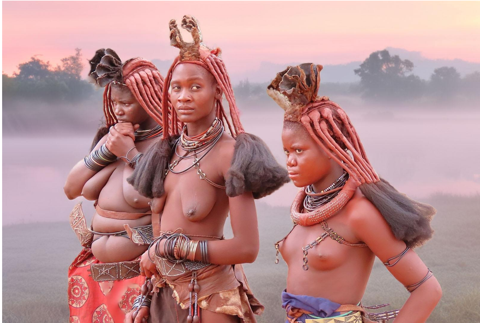
NPS eHM | three Himba sisters | Luc WABBES | Belgium