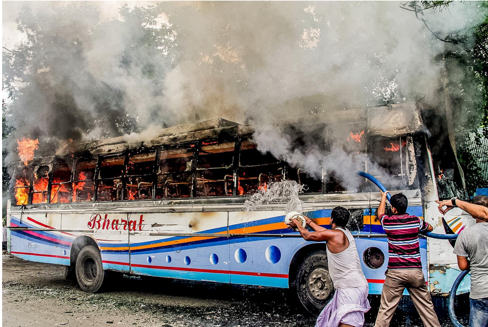
PSA HM Ribbon | THE BURNING BUS | MANASI ROY | India