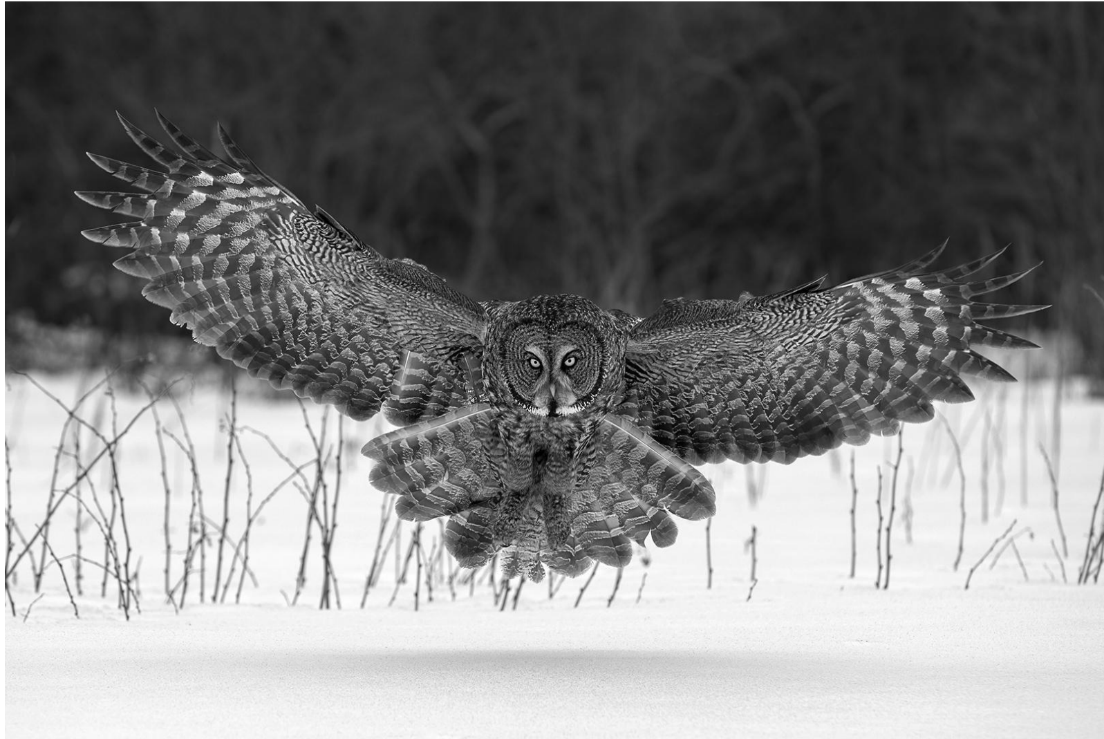
NPS Ribbon | Great Gray owl | Tin Sang Chan | Canada