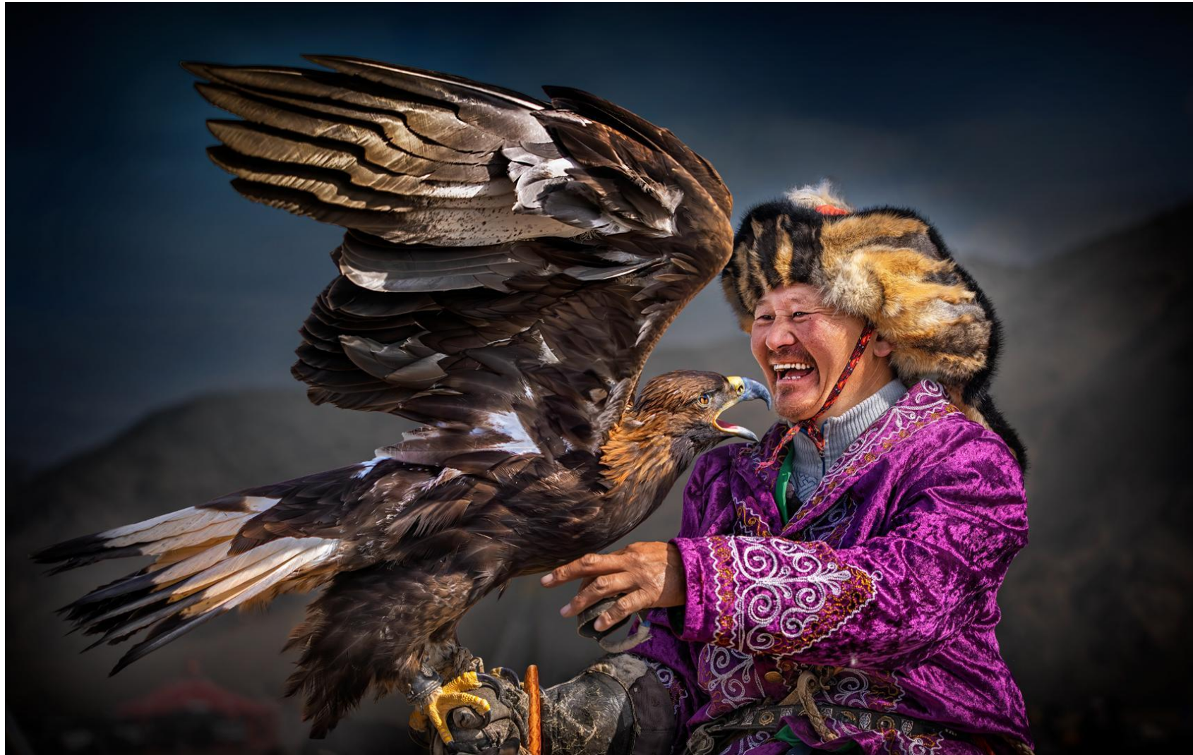
PSA HM Ribbon | Eagle Hunter 303 | Hau Chi Chak | Hong Kong