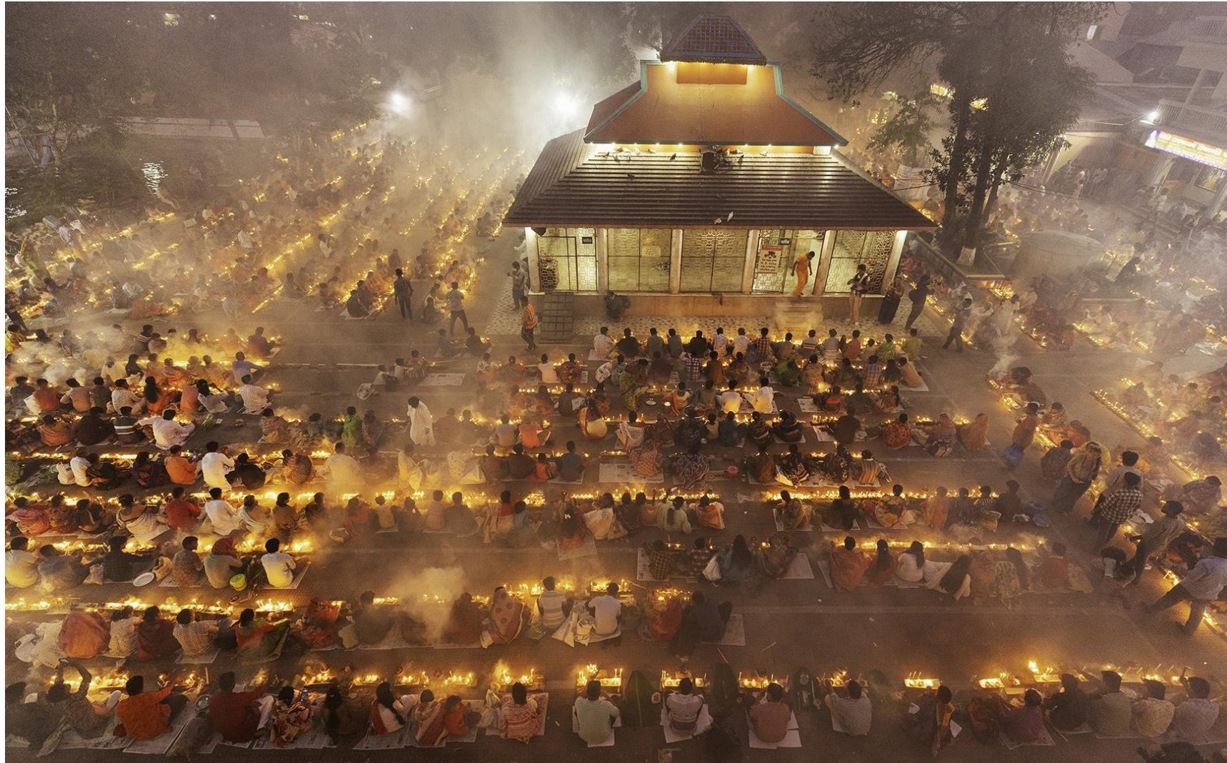
NPS eHM | Candle Light 90 | Phillip Kwan | Canada