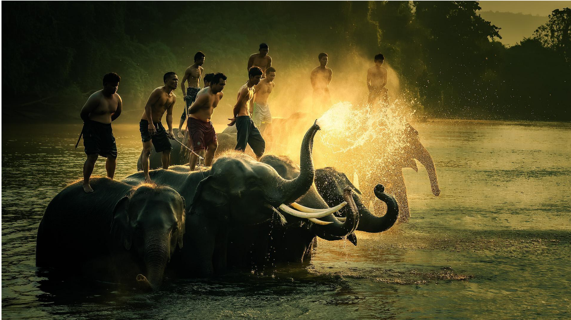
NPS eHM | squirt team | Engseng Saeyang | Thailand