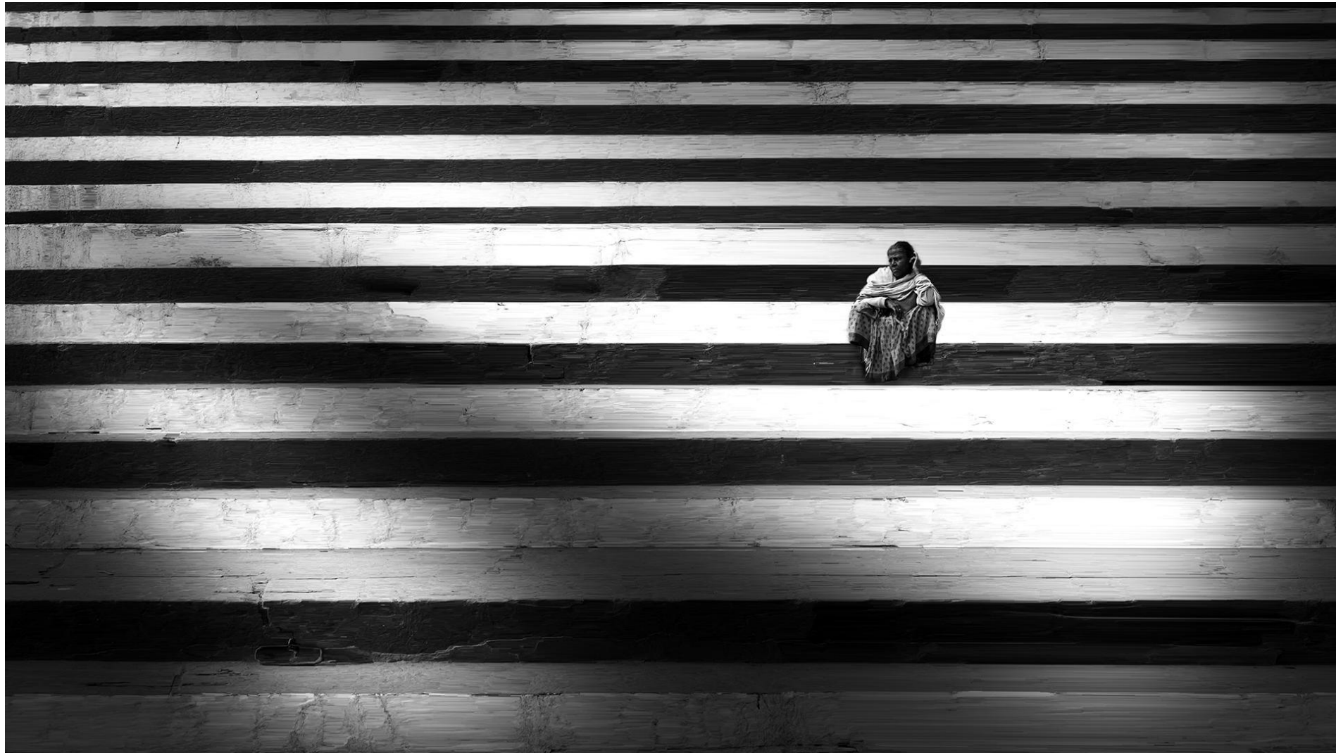
NPS eHM | Alone Or Lonely | SUNIL VYAS | India