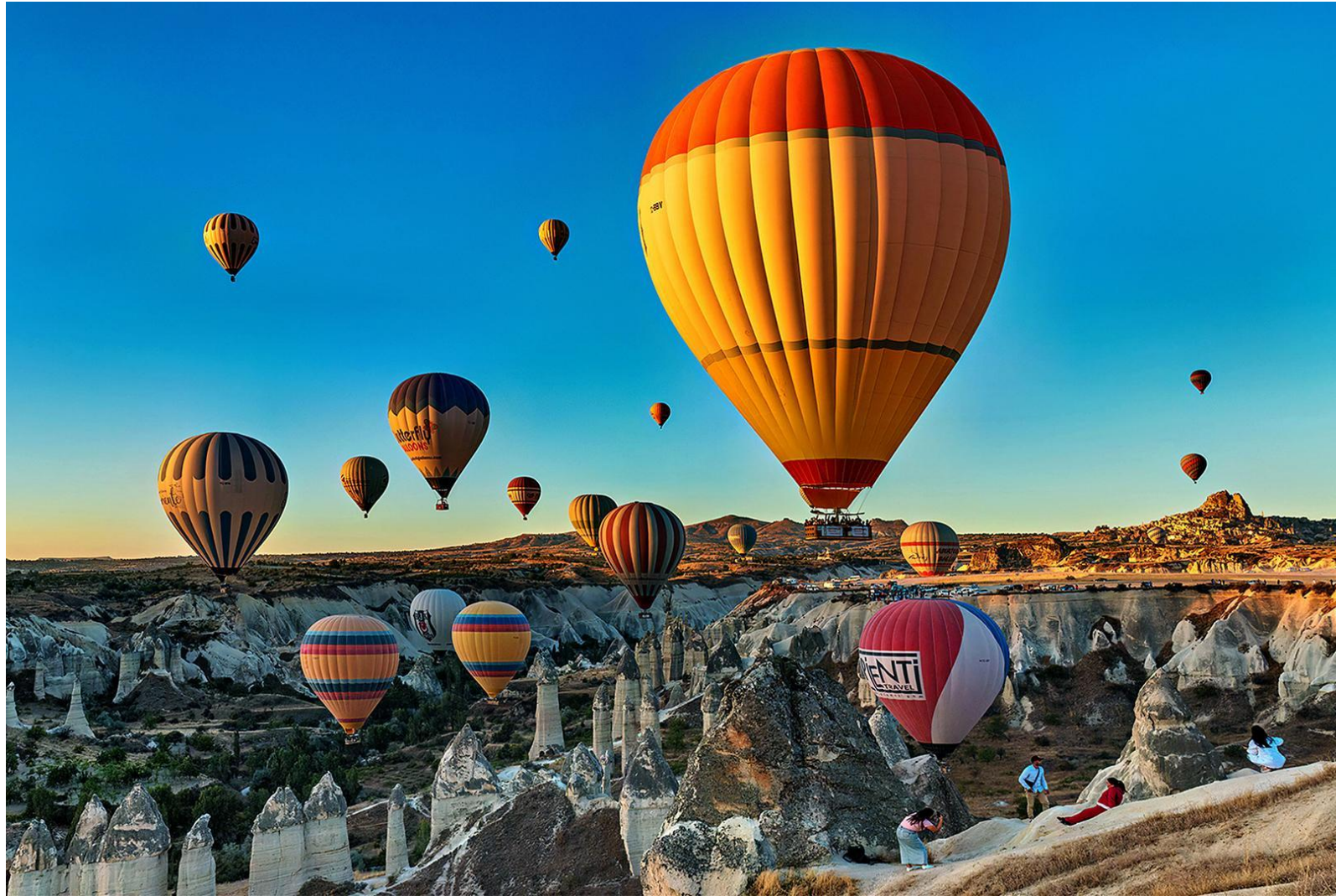
PSA Gold Medal | a Colorfull Day | Atila Karaderi | Cyprus