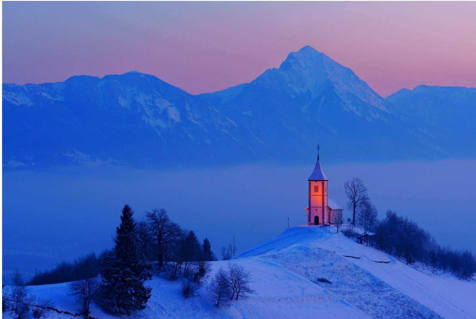
NPS Silver Medal | Jamnik-Z400 | Aleksander Cufar | Slovenia